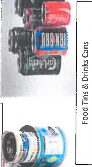
Food Tins & Drinks Cans