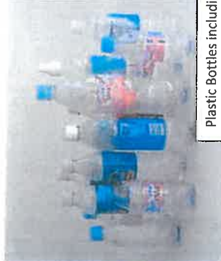
Plastic Bottles including Shampoo Bottles