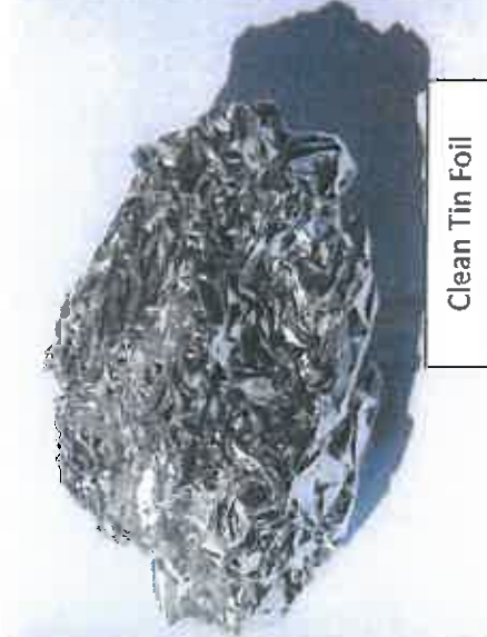
Clean Tin Foil