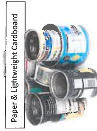
Paper & Lightweight Cardboard